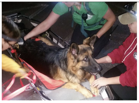
Check out <u>more photos from Wiley's rescue</u> at our new blog!

On October 16, 2018 at 10:30 p.m. WASART teamed up with King County Explorer Search and Rescue (ESAR) to assist with a dog who needed help down Mailbox Peak Trail.